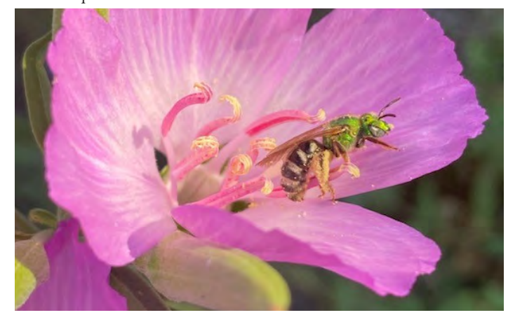
A native metallic green sweat bee (Agapostemon virescens) enjoying Farewell-to-Spring (Clarkia spp.), one of the native forbs planted in our pollinator gardens!

Thanks to the Portland Audubon Society for their continued facilitation of the Christmas Bird Count, which serves not only to create community and an opportunity for birders to give back, but also provides essential data that assists conservationists