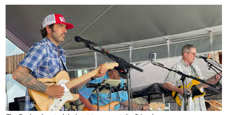
The Dudes donated their set to support the Friends.

A vendor market and conservation exhibitor area added a special touch to the festival. The USFWS Jr. Duck Stamp exhibit received a lot of interest as did the other booths from Tualatin Soil & Water Conservation, Tualatin Riverkeepers, Xerces Society, USFWS and the Friends. The committee focused on local artisans from diverse backgrounds to offer a free space to sell their creations.