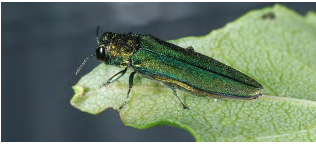
Adult Emerald Ash Borer

For more information, go to http://www.emeraldashborer.info/