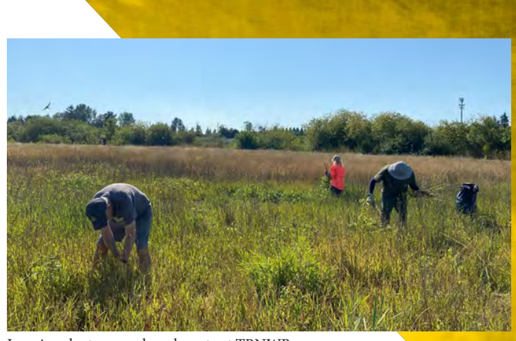
Invasive plant removal work party at TRNWR.

soils, among many other benefits. This burn represents a major accomplishment for the restoration program and its partners. We appreciate the efforts of everyone that made this burn possible, and we look forward to seeing a wide array of native forbs, seeded by Clean Water Services, blooming there this spring.