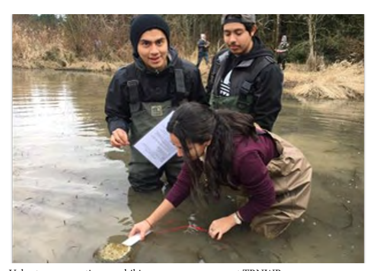
Volunteers conucting amphibian egg mass surveys at TRNWR.

The Friends HRS position assisted Refuge staff by conducting weekly waterfowl surveys at both Refuges this year. These surveys capture important information regarding what species are present, what habitat or vegetation they are using, and how successful our efforts are in giving them the habitat their populations need to succeed. This year we witnessed canvasback ducks, Dusky Canada geese, tundra swans, and many more species utilizing the habitat that our staff and volunteers work so hard to restore!