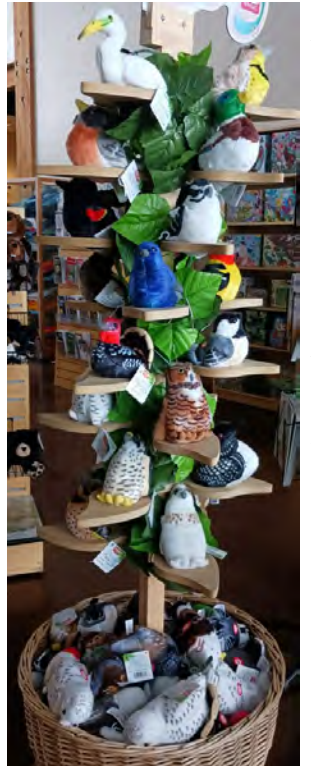
Educational and cuddly offerings at the store.

It was another busy year in the Refuge Visitor Center and the Friends' retail store, Nature's Overlook. About 18,000 visitors came into the building to see the exhibits, get (and share) information, and shop. As this past fiscal year began, the Visitor Center had been open only a few months following a long closure due to the Covid pandemic. Visitors let us know that they were very happy to be able to enjoy the building and the activities again.