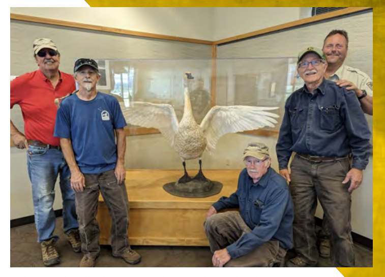
Refuge staff and volunteers made a new home for the Trumpeter Swan in the Riparian Room.

We recently acquired a new "resident" in the Visitor Center. A taxidermied Trumpeter Swan is now on display in the Riparian Room. He was found deceased at Wapato Lake National Wildlife Refuge, and the decision was made to preserve him for educational purposes. The Friends funded