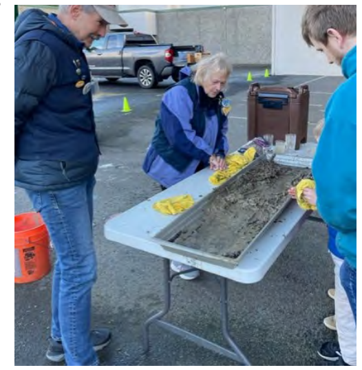
Naturalist volunteers at the mini Greenway Bird Festival

students once again embarked on a Changemaker project, in which all classes addressed some sort of environmental issue. One class worked with Beaverton School District's