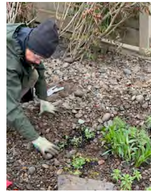
Volunteer planting a pollinator garden at Refuge HQ

of the Refuge HRS Carly, provides both habitat and forage for native pollinators and accessible education for visitors. Each garden exemplifies a different style of pollinator feature, from showy wildflowers to drought tolerant blooms. These gardens create a powerful visual narrative for visitors—YOU can create pollinator habitat wherever you live! Thanks to the Friends for their facilitation of this project, and to our partners that made it possible, Sherwood Rotary 5100 and One Tree Planted.