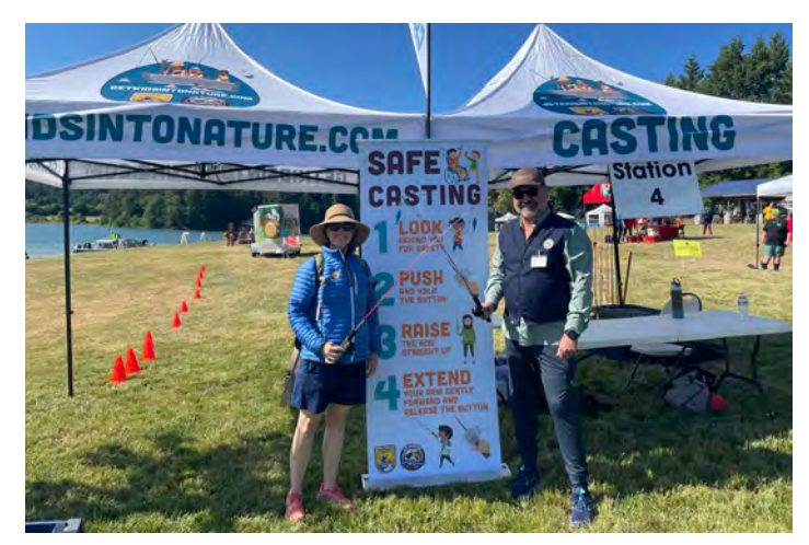
Refuge staff and volunteers at I'm Hooked Great Outdoor Experience Event