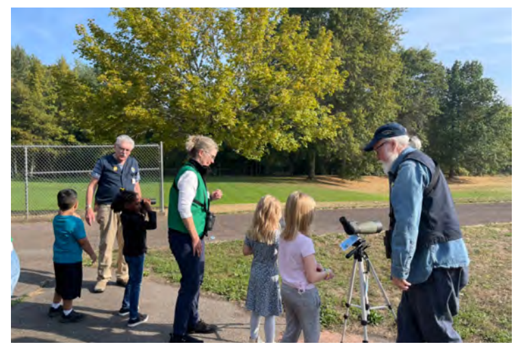
Volunteers guide students in bird watching during "Friday with the Friends."

students once again embarked on a Changemaker project, in which all classes addressed some sort of environmental issue. One class worked with Beaverton School District's