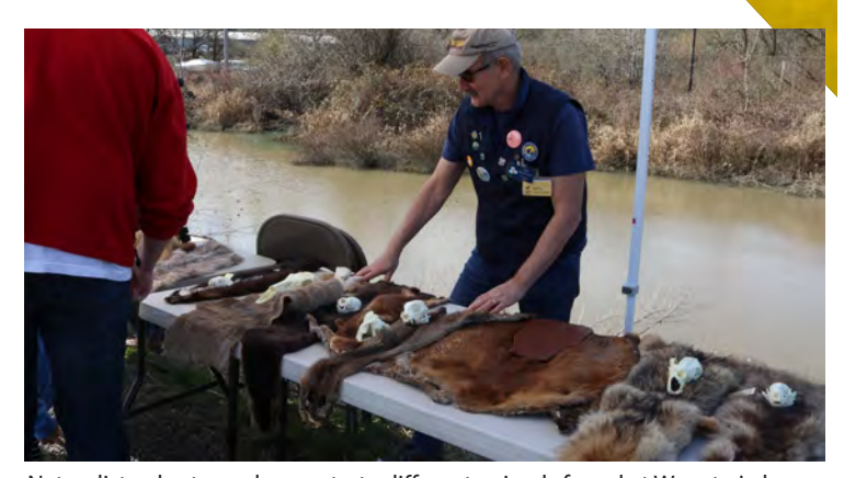
Naturalist volunteers demonstrate different animals found at Wapato Lake NWR for the opening celebration

While Wapato Lake NWR opened to the public in October of 2022, the Refuge hosted an official welcoming ceremony and celebration in March of 2023. Representatives from U.S. Fish and Wildlife Service, the Confederated Tribes of Grand Ronde, Friends of Tualatin River NWRC, City of Gaston, and a congressional representative all made remarks. Festivities took place at Gaston Jr./Sr. High School, and of course at Wapato Lake NWR. The day couldn't have been possible without volunteers who