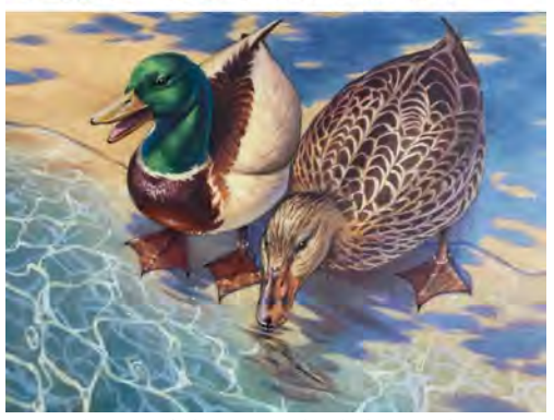
Oregon's Best of Show won third place in the National Junior Duck Stamp Competition!

Inspired by the art you see in this contest? Learn more about the K-12 art & science program and get youth involved: https://www.fws.gov/program/junior-duck-stamp/junior-duck-stamp-contest-information