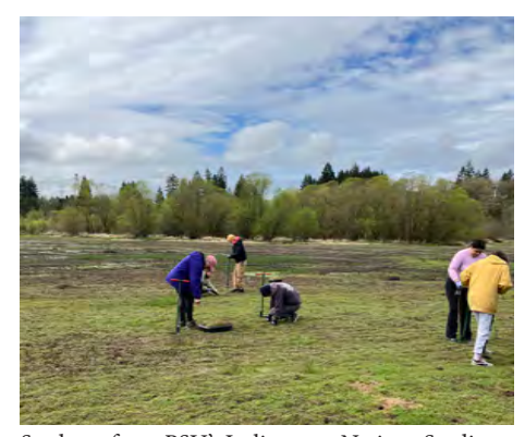
Students from PSU's Indigenous Nations Studies Program plant at the wetland margin.

riparian forests. Scrubshrub wetlands are a priority habitat in the Oregon Conservation Strategy, and serve to support myriad wildlife species. Other 2022-2023 plantings served to expand riparian forests on the Refuge. These forests play an integral role in maintaining stream health by providing