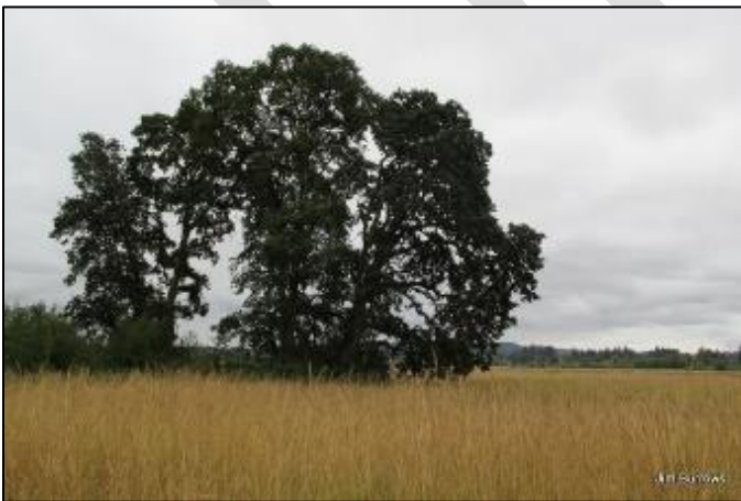
Figure 2. Oregon white oaks on Tualatin River NWR.

Atfálat’i Unit, is slowly growing into mixed forest. It has too many small oak trees per acre to function as a savanna, woody shrubs from lack of disturbance, and invasive grass species. Finally, the large diameter, mushroomed shaped oaks scattered across the refuge will be retained if possible.