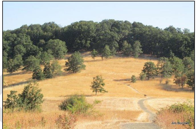
Figure 1. Oak savanna (foreground) and oak woodland (background).

A recent study identified 185 vertebrate species that are associated with oak savannas and woodlands. This list includes 21 reptiles and amphibians, 106 birds, and 58 mammals. The large oaks provide key wildlife features in both